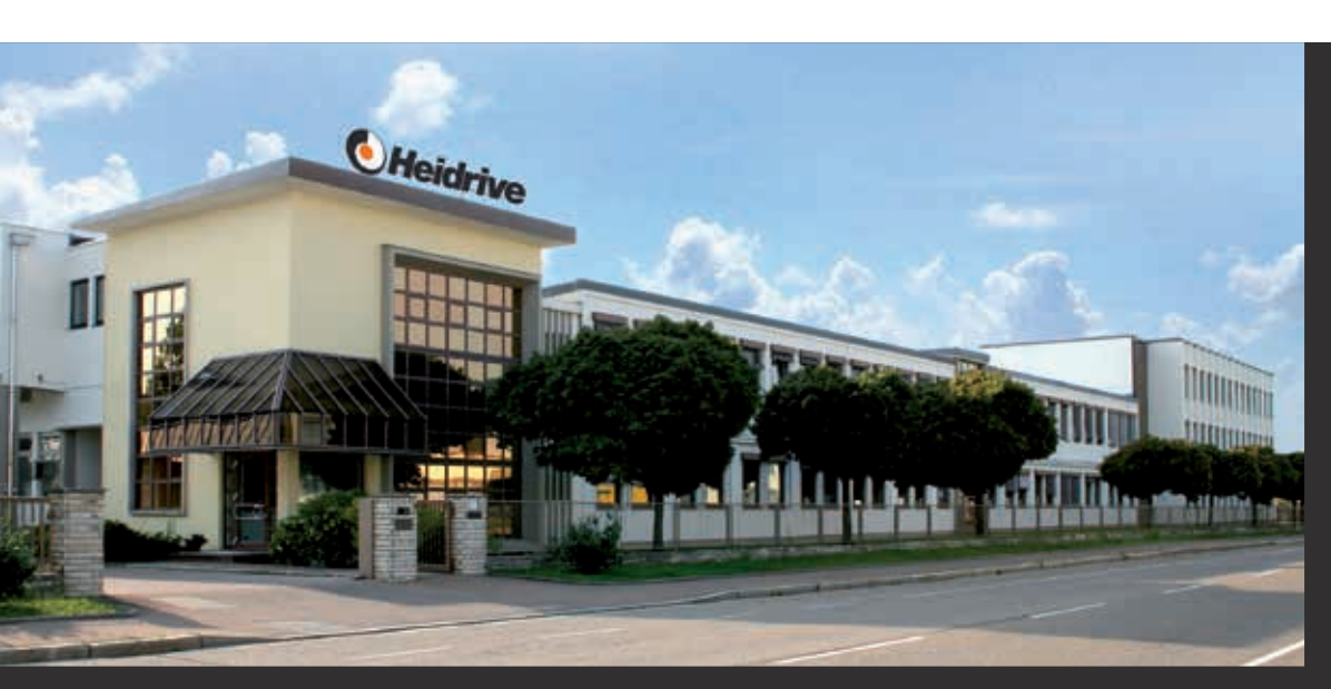
Our location in Kelheim, Germany, with over 300 employees makes us one of the largest employers in the region.

Electronic controls: Servo drives up to 15.5 kW EC controllers up to 0.50 kW